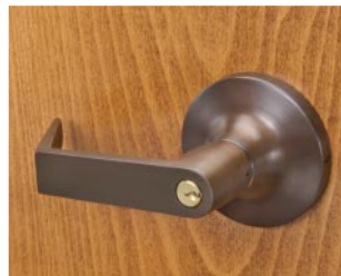
613 Finish Dark Oxidized Satin Bronze, Oil Rubbed Effective May 1, 2010 (New)