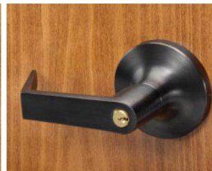
722 Finish Black Oxidized Bronze, Oil Rubbed Effective May 1, 2010 (Previous 613 designation)