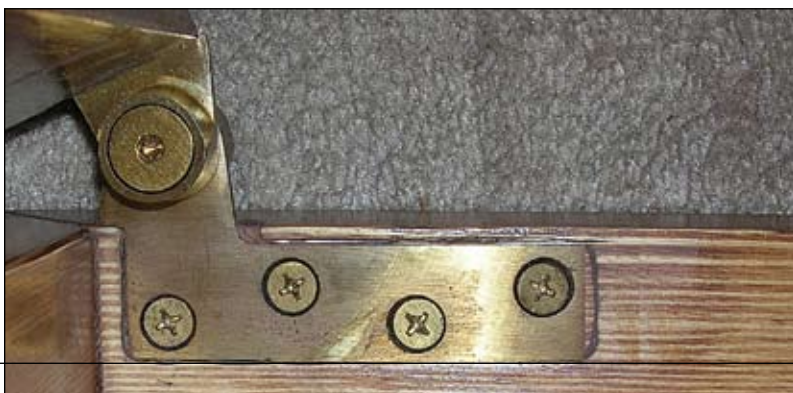
Top pivot jamb leaf

point 3/4" from the heel edge of the door and 3/4" from the face of the door. This pivot is known as a 3/4" offset pivot. For thicker doors and specialized applications, the pivot point is 3/4" from the heel edge of the door and 1-1/2" from the face. This pivot is known as a 1-1/2" offset pivot.