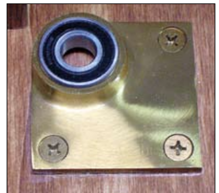
From Top to Bottom: Bottom pivot; Cover removed from bottom pivot; Bottom pivot floor mounted plate

and the threshold and the door and the header, then, if the height is correct, tighten the arm locking screw.