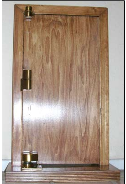
Rixson manufactured door

Typically, offset pivots are available with the pivot