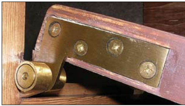
Top pivot door leaf