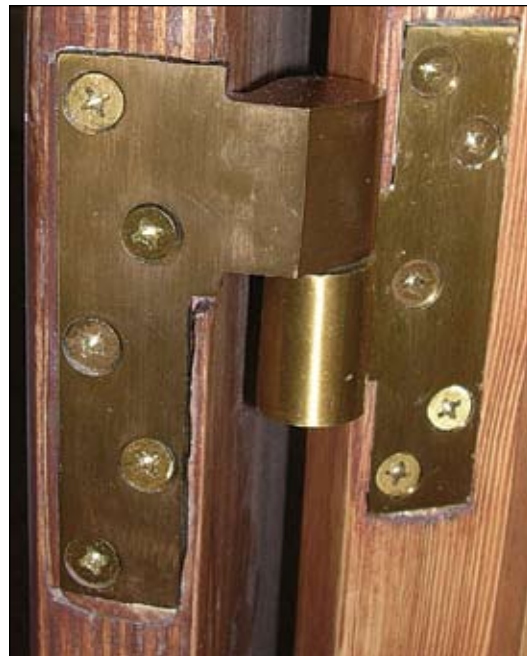
Intermediate pivot open

The pivot stud seats into a sealed thrust bearing raceway that is press fit into the bronze floor mounted plate of the 147. As the door swings open or closed, the bottom pivot stud carries the weight of the door against the thrust bearing. The bearing rotates, turning the door as it swings open and closed.