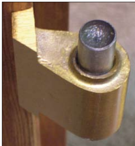
Intermediate pivot stud