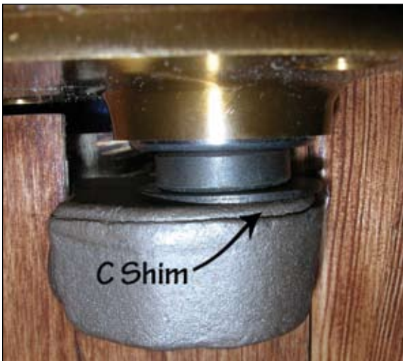
"C" shim installed in bottom pivot

The next step is to check if the pivots are in adjustment. This can also result in the door dragging along the floor/threshold or