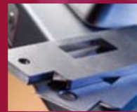
Center Bolt Strike 1/4" stainless steel strike versus 1/8" standard wrought strike