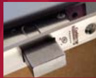
Center Bolt Stainless steel deadbolt with 1" projection