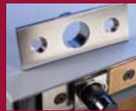
Bottom Bolt 3/4" diameter steel with 3/4" projection