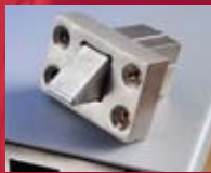
Top Latch 5/8" stainless steel housings, 3/4" projection with 1/8" door gap