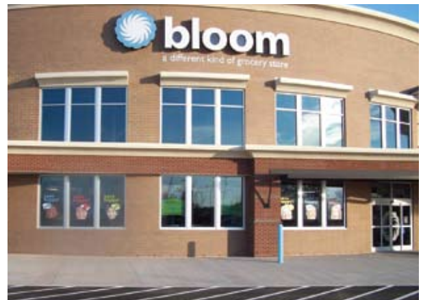
BESAM provides innovative solutions, flexible options and professional service